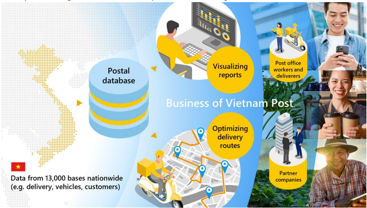
Tokyo, July 6, 2023 – Hitachi, Ltd. (TSE: 6501, "Hitachi") starts the development of digital infrastructure and demonstration of transport digital transformation of Vietnam Post, a government-run company in Vietnam, in preparation for digitalization with a focus on postal services throughout the Socialist Republic of Vietnam ("Vietnam").

Hitachi chosen as subcontractor in the Ministry of Internal Affairs and Communications' experimentation to demonstrate the feasibility of introducing Japanese digital transformation practices in with government-run Vietnam Post